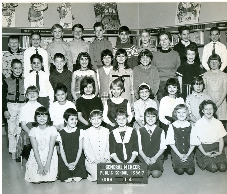
Eric Walters (second row from the top, third from the left) with his Grade 5 class.